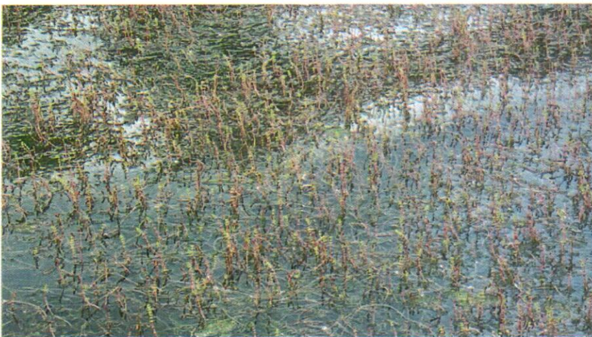
Eurasian milfoil canopy.

Millions of dollars are spent annually in Michigan to control Eurasian milfoil.